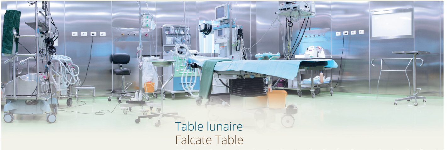
Table lunaire Falcate Table